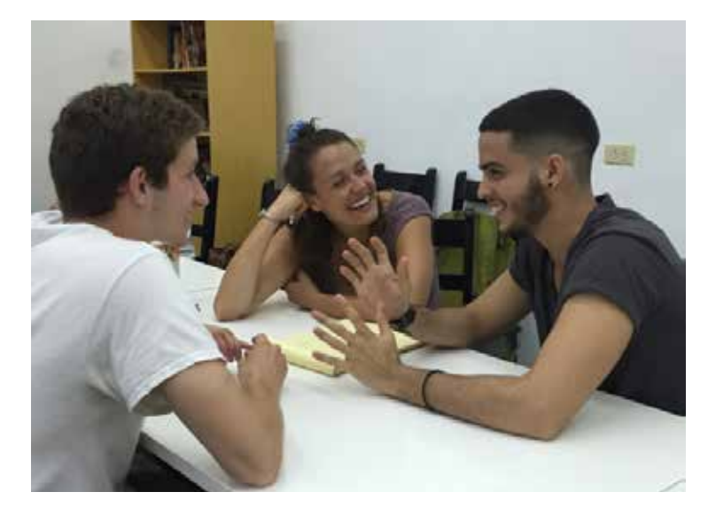
US CASA Program and Cuban students at the weekly language tandem

Just as it is impossible to define a typical American, it is equally impossible to define a typical Cuban. You will meet many types of people in Cuba who have different opinions, attitudes, and habits. The more you interact with Cuban people, the better chance you will have of forming relationships and understanding the culture. During these interactions, use common sense, intelligence, and a sense of objectivity. Be prepared to discuss your views freely and openly, try to listen with an open mind, and be respectful of others' views, no matter how much they may be different from your own.