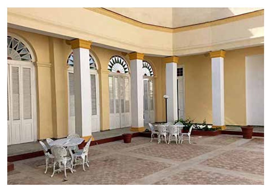
Interior courtyard at Haydee Santamaria Gallery.

The program aims to ensure that students will return with an invigorated sense of inquiry, a better understanding of the complex situation facing Cuba today, and a wealth of knowledge obtained through in-country learning experiences that will challenge you in many ways, taking you beyond your comfort zone and teaching you more than you ever imagined.