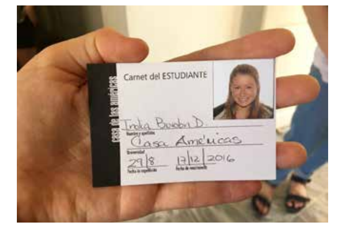
Student identity card provided by Casa de las Americas

The CASA program will cover the cost of hotel accommodations for the nights of January 26th and 27th , and all meals and excursions related to the program in Miami.